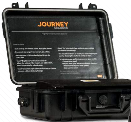
Optional Scanner (side 2)

The Journey 8 Tablet is an 8-inch, high-resolution touchscreen tablet with built-in cellular modem and GPS.